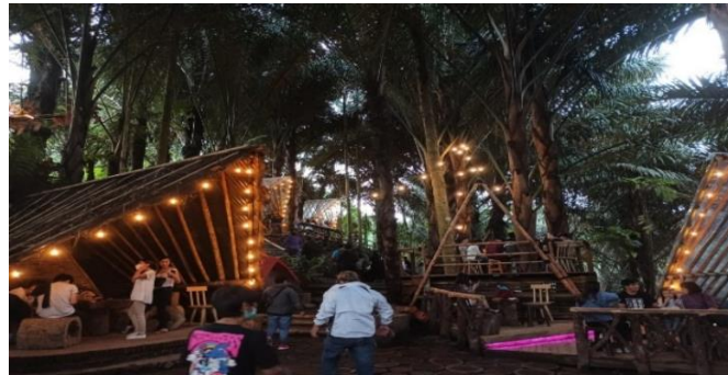
Figure 4. Tu'ur Ma'asering

Leilem hot springs are a natural tourist attraction located in Lahendong Village, South Tomohon, which has many advantages, in addition to the hot springs, it also has several open and very interesting photo spots. The road access is quite smooth and safe with a travel distance from the center of Tomohon, approximately 12 minutes from the center of Tomohon. This object has several natural hot springs, in addition to having several open and very interesting photo spots with a fairly large parking area and public toilets.