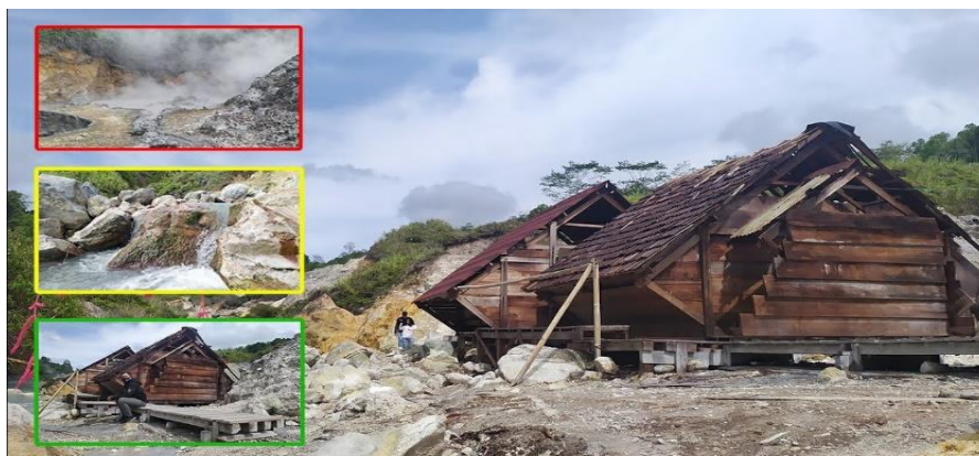
Figure 3. Leilem Village Hot Springs

Lake Linow is a volcanic lake that has a very stunning natural beauty besides being able to see the beauty of the lake there we can also see the stunning view of Mount Lokon. Access to the road is quite smooth and safe with all roads already covered with asphalt, the Lake Linow tourist attraction with a travel distance from the center of Tomohon city is approximately 22 minutes and an entrance fee of 35,000 per person. In addition to the scenery and fairly easy and safe access, Lake Linow also has many amenities including a fairly large restaurant with quite a lot of seating, various culinary delights, a large parking area and 2 toilets that are open to the public besides that when entering the object ticket obtained when entering can be exchanged for a cup of tea or hot coffee.