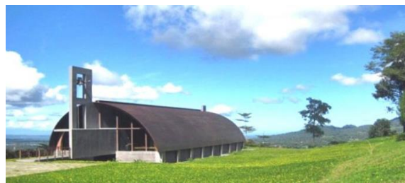
Figure 5. Mahawu Prayer Hill

Tu'ur ma'asering is a natural tourist attraction that follows a path and is slightly uphill, with a view of large sugar palm trees neatly arranged on the left and right of the road. The road access is quite smooth and safe with a distance of approximately 20 minutes from the center of Tomohon City. Arriving at the main yard, there are many huts and wooden chairs where tourists can rest and relax. The huts and all facilities are made of wood and bamboo in various shapes. In addition, the object has a restaurant and toilet, with an entrance ticket of 15,000 which can later be exchanged for local Minahasa drinks, namely Saguer and cap tikus liquor.