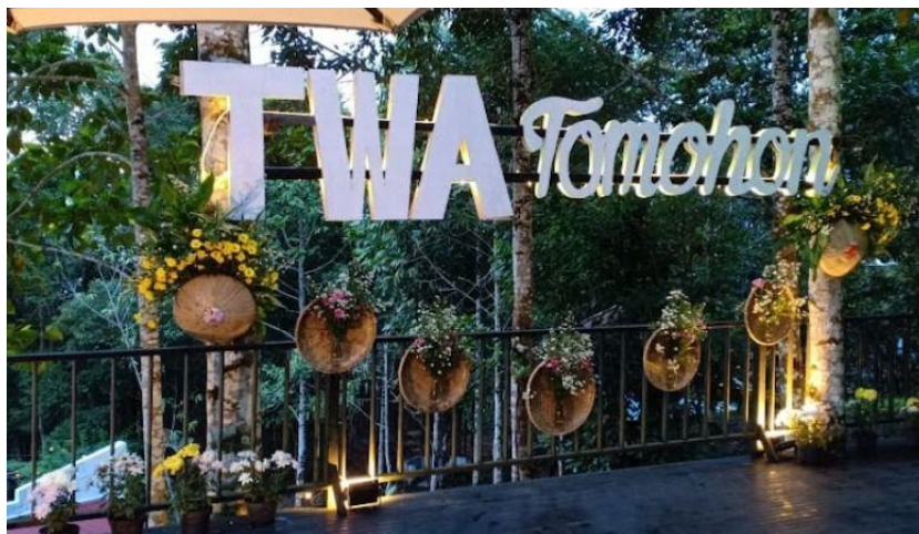
Figure 11. Nature Tourism Park

Alfa omega tower is a religious-based tourist attraction (GMIM) which has a beautiful flower garden and is located in the center of Tomohon city. In addition to being able to see the object, we can also explore the beauty of Tomohon city. This object is located in the center of Tomohon city and the estimated distance from Manado city is approximately 1 hour. The tourist motorcycle taxi itself has a small parking lot and has many small shops selling various cold drinks and snacks.