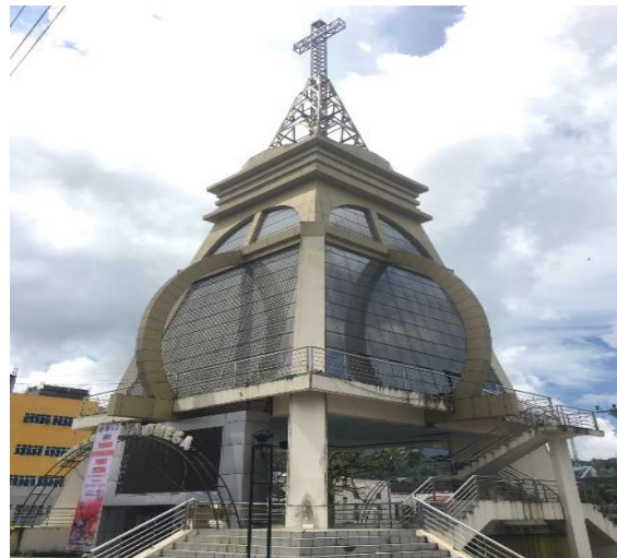
Figure 10. Alfa Omega Tower

Alfa omega tower is a religious-based tourist attraction (GMIM) which has a beautiful flower garden and is located in the center of Tomohon city. In addition to being able to see the object, we can also explore the beauty of Tomohon city. This object is located in the center of Tomohon city and the estimated distance from Manado city is approximately 1 hour. The tourist motorcycle taxi itself has a small parking lot and has many small shops selling various cold drinks and snacks.