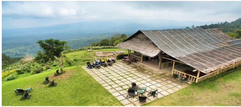
Figure 8. Rurukan Tourism Village

Sunrise in Rurukan Village is truly a winner you can wake up in the morning greeted by blooming flowers and expanses of terraced vegetable plantations. As far as the eye can see, only flowers and vegetables are visible like a colorful carpet that soothes the eyes. As is known, the city of Tomohon is the main producer of flowers in North Sulawesi. The road access is quite smooth and safe with a distance of approximately 12 minutes from the center of Tomohon city. Important facilities such as toilets and parking lots can be said to be adequate. You can also find a cafe with an entrance fee of 15,000.