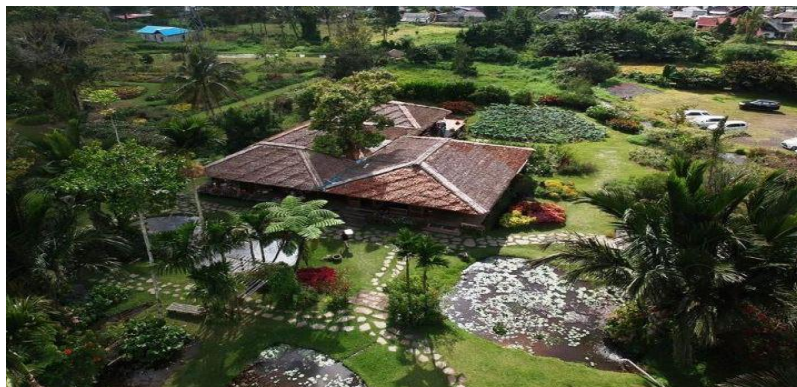
Figure 9. Gardenia Country Inn

Sunrise in Rurukan Village is truly a winner you can wake up in the morning greeted by blooming flowers and expanses of terraced vegetable plantations. As far as the eye can see, only flowers and vegetables are visible like a colorful carpet that soothes the eyes. As is known, the city of Tomohon is the main producer of flowers in North Sulawesi. The road access is quite smooth and safe with a distance of approximately 12 minutes from the center of Tomohon city. Important facilities such as toilets and parking lots can be said to be adequate. You can also find a cafe with an entrance fee of 15,000.