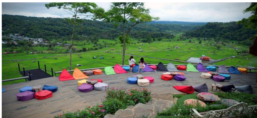
Figure 7. Kaisanti Garden

Narwastu Hill is one of the best spots to enjoy the city of Tomohon from a height. Here we can see the city of Tomohon with the background of Mount Lokon standing behind it. The road access is quite smooth and safe with a distance of approximately 9 minutes from the center of Tomohon city. With quite complete amenities. Starting from various photo spots, outdoor cafes, lodging, meeting rooms, to wedding venues. You can relax in the cafe while ordering a variety of food and drink menus. The outdoor cafe has a green grass floor and overlooks the enchanting Mount Lokon. The hanging light bulb decoration will give a romantic impression when the night comes. With an entrance ticket price of 30,000 you will get a voucher that can be exchanged for a cup of coffee or hot tea and mineral water