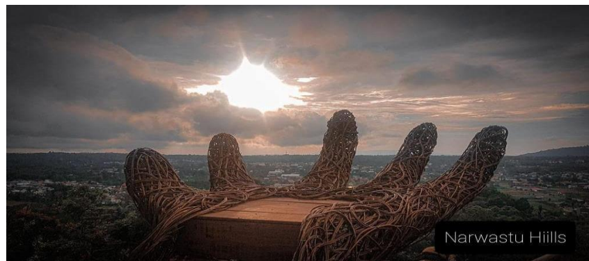
Figure 6. Narwastu hills

Narwastu Hill is one of the best spots to enjoy the city of Tomohon from a height. Here we can see the city of Tomohon with the background of Mount Lokon standing behind it. The road access is quite smooth and safe with a distance of approximately 9 minutes from the center of Tomohon city. With quite complete amenities. Starting from various photo spots, outdoor cafes, lodging, meeting rooms, to wedding venues. You can relax in the cafe while ordering a variety of food and drink menus. The outdoor cafe has a green grass floor and overlooks the enchanting Mount Lokon. The hanging light bulb decoration will give a romantic impression when the night comes. With an entrance ticket price of 30,000 you will get a voucher that can be exchanged for a cup of coffee or hot tea and mineral water